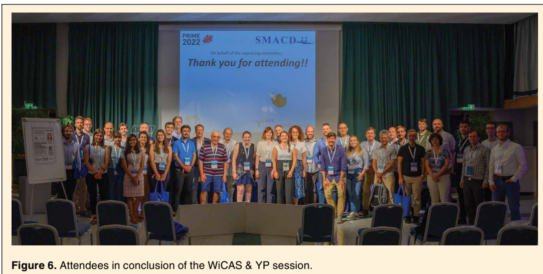
Figure 6. Attendees in conclusion of the WiCAS & YP session.