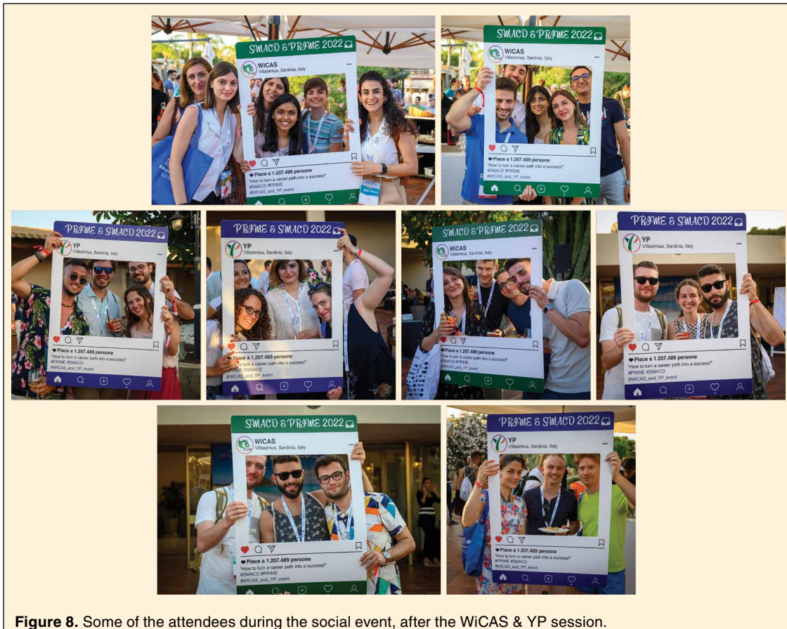
Figure 8. Some of the attendees during the social event, after the WiCAS & YP session.