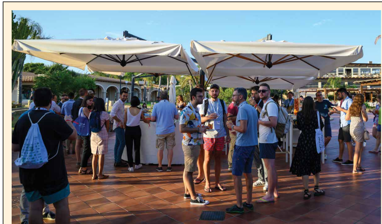
Figure 7. Attendees enjoying the cocktail after the WiCAS & YP session.